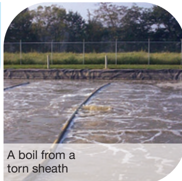
A boil from a torn sheath