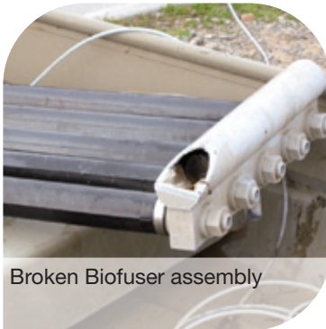
Broken Biofuser assembly