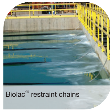
Biolac® restraint chains

This exclusive service provides a one-year warranty for the Biolac® system with an on-site certified rebuild or supervised on-site rebuild. When the rebuild or retrofit is completed, a Parkson-certified specialist will provide an operational refresher course to ensure smooth start-up of the equipment.