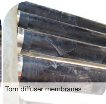
Torn diffuser membranes