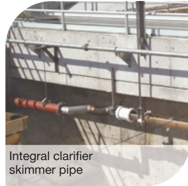
Integral clarifier skimmer pipe